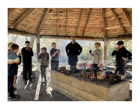
<u>Southend United, National League U11</u> <u>Cup</u>

shot an arrow and we had to try and shoot ours further. He shot it a long way away so it was quite hard. Then when we finished the activity we headed over to pack all our stuff and meet in the middle of the centre. We then got on the coach and headed home. My favourite was the high ropes because it was very fun and we got to see what was around us. The whole trip was magnificent and I wish we could visit there again."