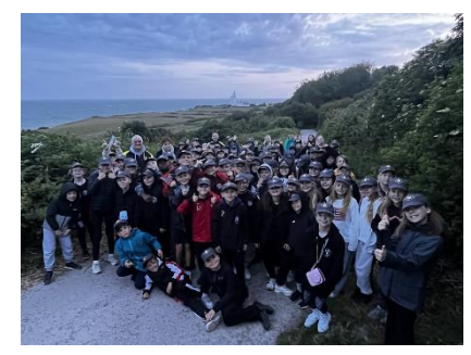
we went out to Osborne House. The only

the beach there was lots of sand and the sea wasn't in. Lots of children were digging and making little rivers. After that we went back into the hotel and we had some time in our room and then went to sleep. I slept ok as I was really tired from my very long day. On Tuesday, we got up to a cooked breakfast which was really yummy and then as soon as we finished breakfast