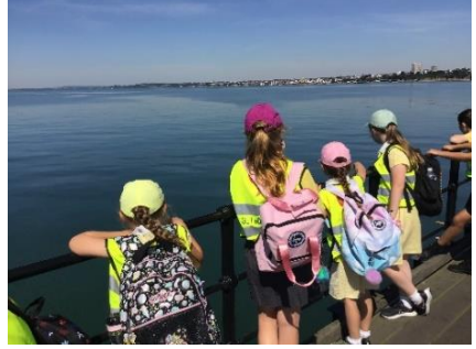
Year 2 visit to Hyde Hall

lolly stand to the north and the sea to the south. When we finished, we walked back down the pier. It was really hurting our